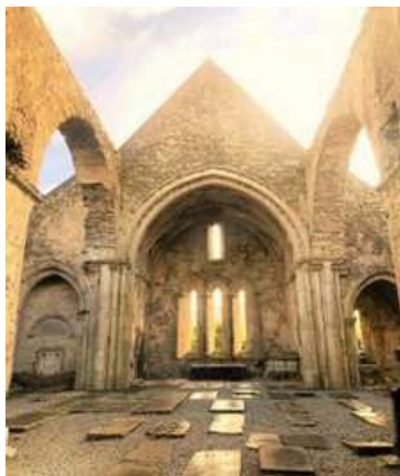
Corcomroe Abbey, County Clare, Ireland

by John O'Donohue (from Dawn Mass Reflections at Corcomroe Abbey)